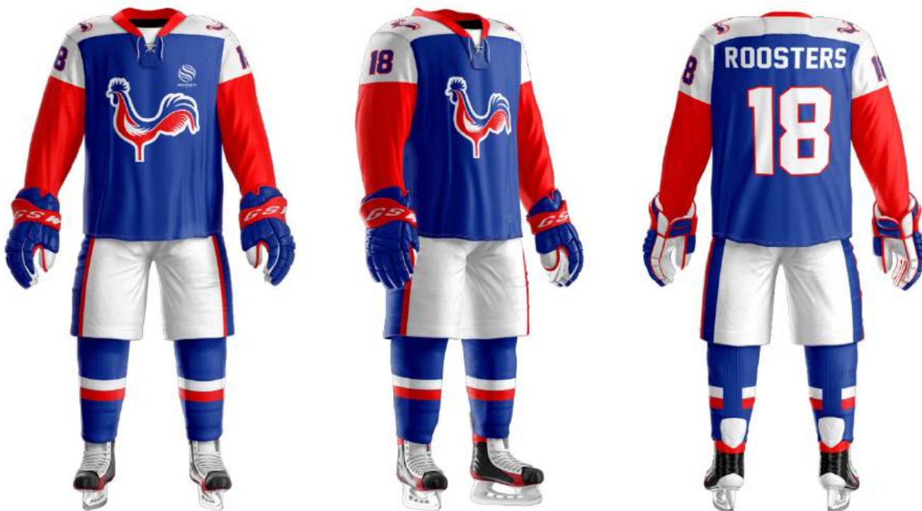
Color: Black | Blue | Grey | Green | Red | Custom Color ART# RS-TU-802

Size: S | M | L | XL | XXL | 3XL | Custom Size